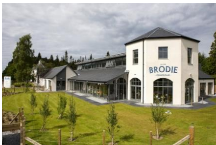
Brodie countryfare (Forres)

Situated in a relaxing rural environment, we have created one of the most pleasant shopping experiences in the North of Scotland, providing a blend of quality and a traditional Scottish welcome.