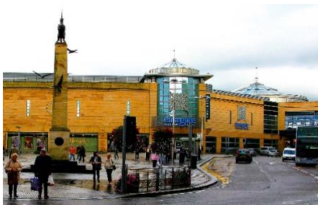
Eastgate shopping centre (Inverness)

Eastgate Shopping Centre, with over 350,000 sq ft of fabulous shopping, provides Inverness residents and visitors with an unequalled shopping experience.