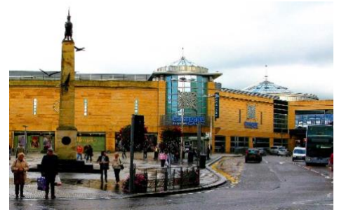
Eastgate shopping centre (Inverness)

Eastgate Shopping Centre, with over 350,000 sq ft of fabulous shopping, provides Inverness residents and visitors with an unequalled shopping experience.