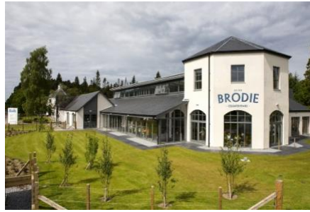
Brodie countryfare (Forres)

Situated in a relaxing rural environment, we have created one of the most pleasant shopping experiences in the North of Scotland, providing a blend of quality and a traditional Scottish welcome.